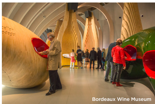
Bordeaux Wine Museum