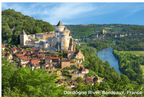
Dordogne River, Bordeaux, France