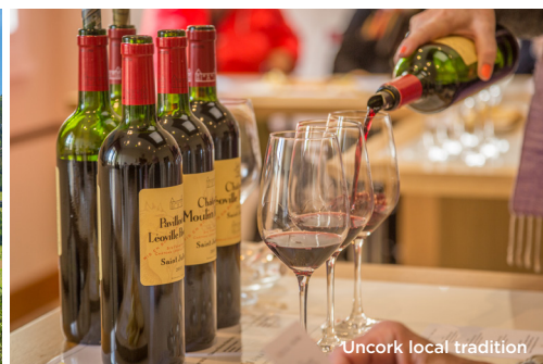
Uncork local tradition